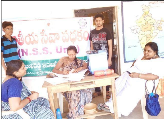
Pulse Polio Immunization Camp in progress...