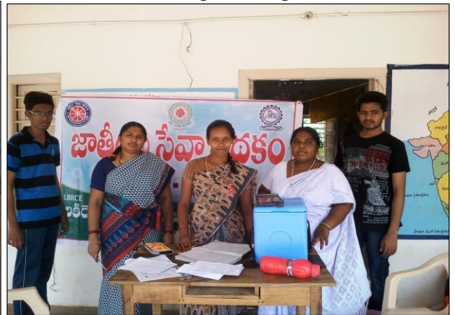
Volunteers posing with the medical staff