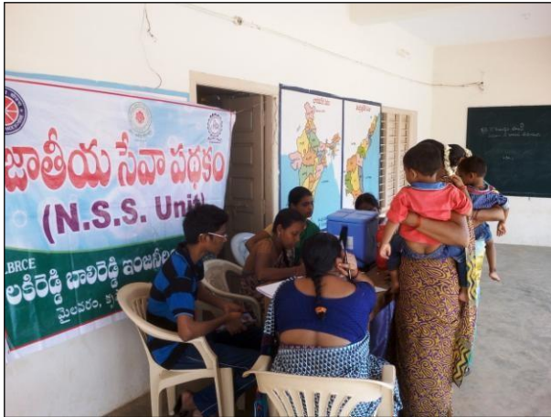
NSS volunteers at the Immunization Camp