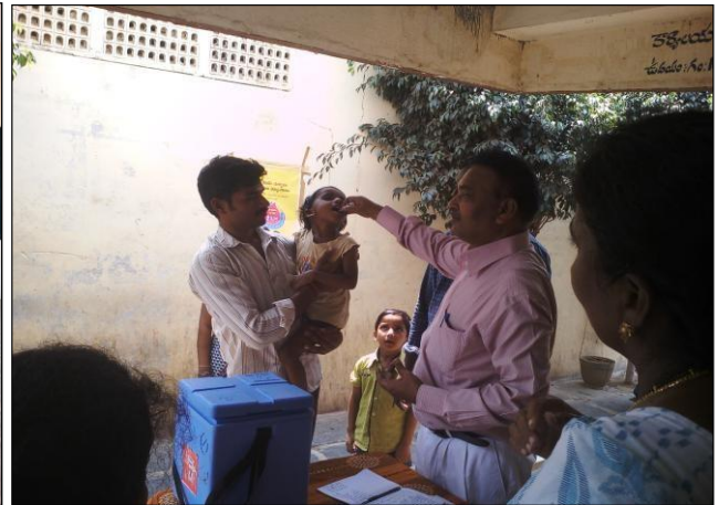
Children administered polio drops